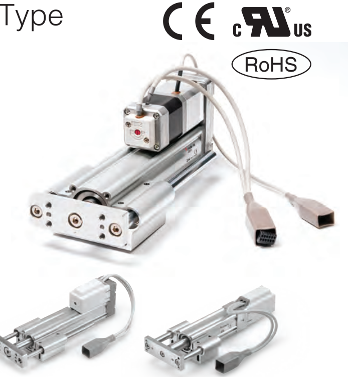
Guide rod type

•Either positioning or pushing control can be selected. Possible to hold the actuator with the rod pushing to a workpiece, etc.